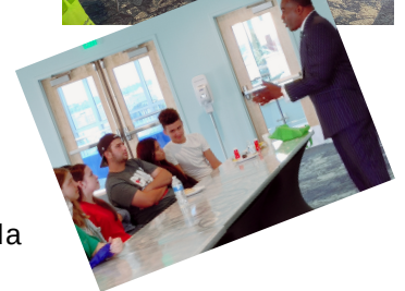
Florida Justice Association

BBBSPBMC would like to thank our generous donors, the Children's Services Council of Martin County, the Jim Moran Foundation, William and Helen Thomas Charitable Trust, BallenIsles Charities Foundation, the Batchelor Foundation, Honda Classic Cares, the Ray and Peg Hirvonen Foundation, and many individual contributors. Without their support our work would not be possible.