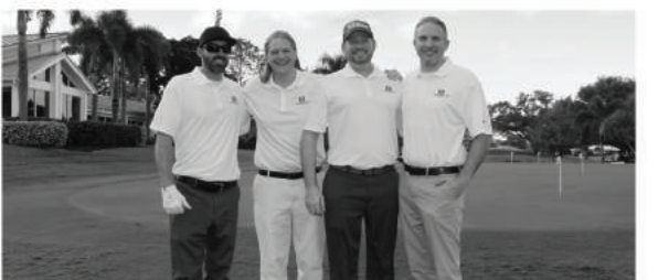
"SANTA'S SLEIGH AND HOLE-IN-ONE SPONSOR, TREASURE COAST TOYOTA, PARTICIPATING IN THE 15TH ANNUAL SANTA CLAUS OPEN GOLF TOURNAMENT AT THE STUART YACHT & COUNTRY CLUB."