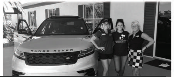
"GOLF CART SPONSOR, JAGUAR LAND ROVER TREASURE COAST, AT THE BIG GOLF OUTING AT EAGLE MARSH COUNTRY CLUB."

An Evening to Remember It Takes a Village