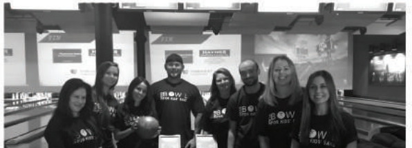
"SPLIT SPONSOR, MDG ADVERTISING, PARTICIPATING IN THE 1ST ANNUAL BOWL FOR KIDS' SAKE EVENT AT CINEBOWL AND GRILLE IN DELRAY BEACH."