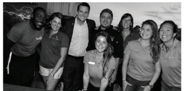
"BEST APPETIZER AND BEST ENTREE WINNERS, KYLE G'S, AT THE 22ND ANNUAL BIG TASTE OF MARTIN COUNTY PRESENTED BY PUBLIX SUPER MARKET CHARITIES AT THE STUART JET CENTER."